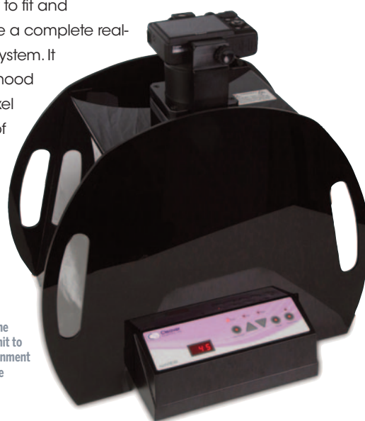
Hood is positioned over the runVIEW tank and base unit to create a light-tight environment suitable for image capture

The runDOC is designed exclusively to fit and complement the runVIEW to provide a complete real-time electrophoresis and imaging system. It comprises a lightweight darkroom hood and a high resolution 24.1 megapixel digital camera to capture images of nucleic acid gels stained with for example Et-Br, SYBR and runSAFE.